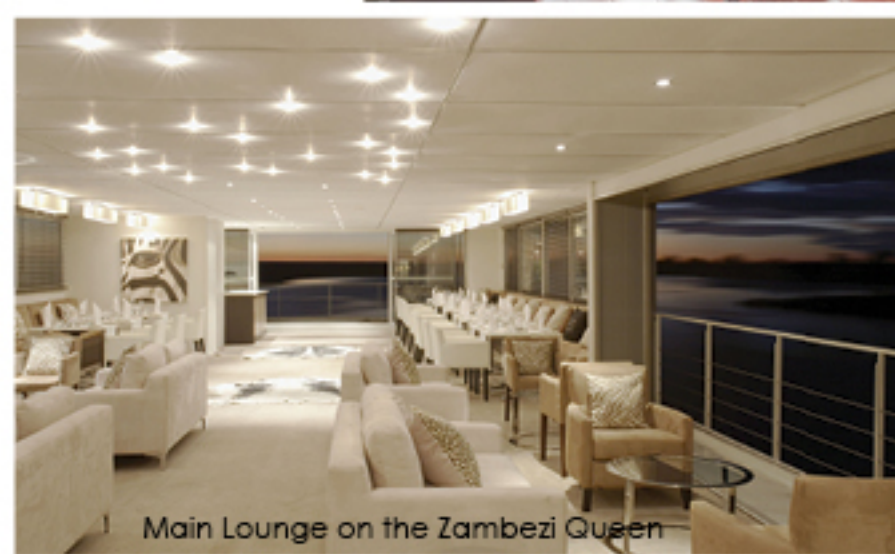
Main Lounge on the Zambezi Queen