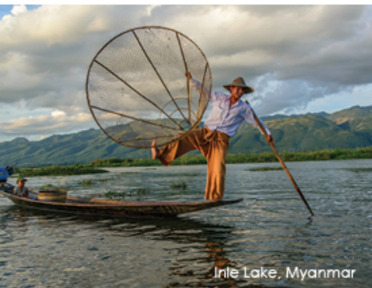
Inle Lake, Myanmar