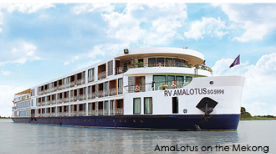
AmaLotus on the Mekong

Perhaps you want to turn your dream honeymoon into a reality with an exotic river cruise that takes you through Vietnam and Cambodia. Our Mekong itinerary offers exclusive excursions that let you discover a world of enlightening cultural and spiritual encounters so that every moment of your journey is one you'll remember forever.