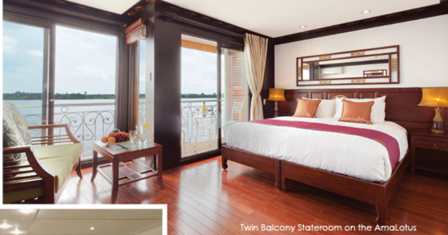
Twin Balcony Stateroom on the AmaLotus