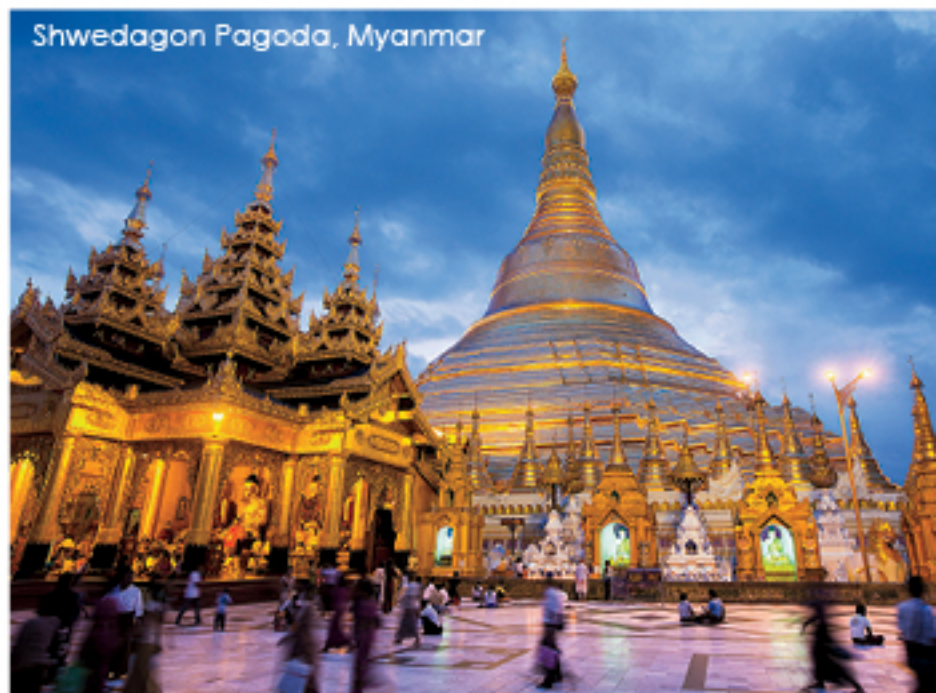
Shwedagon Pagoda, Myanmar

Perhaps a safari honeymoon on the bright and airy 28-passenger Zambezi Queen, which was specifically designed for African river safaris on Botswana and Namibia's Chobe River, is the perfect combination of luxury and adventure. From the ship you are likely to observe elephants, hippos and crocodiles, as well as flocks of birds and other wildlife gathering along the shoreline. On board, you'll enjoy modern accommodations, delicious cuisine and an excellent vantage point for observing the surrounding wildlife. The ship's top deck features an enclosed air-conditioned dining room, lounge and bar— plus an open-air pool deck for relaxing, taking a refreshing dip, or 360-degree game watching. The Zambezi Queen was designed to function as your floating safari lodge and to facilitate optimal game viewing. As the ship leisurely drifts along, you'll encounter amazingly up-close views of animals coming to the river to drink or bathe.