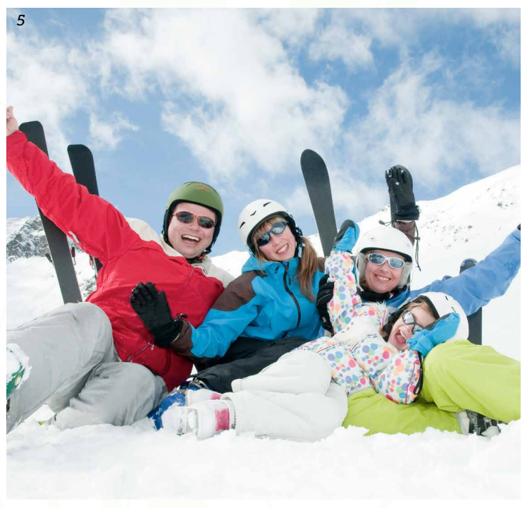
1 Squaw Valley skiing 2 Squaw Valley at night 3 Luxurious accomodations 4 Resort Lobby 5 Fun for the whole family

To soothe those tired muscles after a day on the mountain, the Spa at Squaw Creek offers a tranquility room, massage treatments, facials and body treatments. The Tranquility Room was completed alongside a $7 million guest room renovation further enhancing the Lake Tahoe experience for travelers visiting the region. With the Resort At Squaw Creek's slope-side lodging, cross-country ski center, private ice skating rink and world-class facilities catering to special events, the opportunities to create magnificent memories are abundant. It is no wonder that Californians place Lake Tahoe at the top of their list when looking for a winter wonderland ski vacation surrounded by beauty.