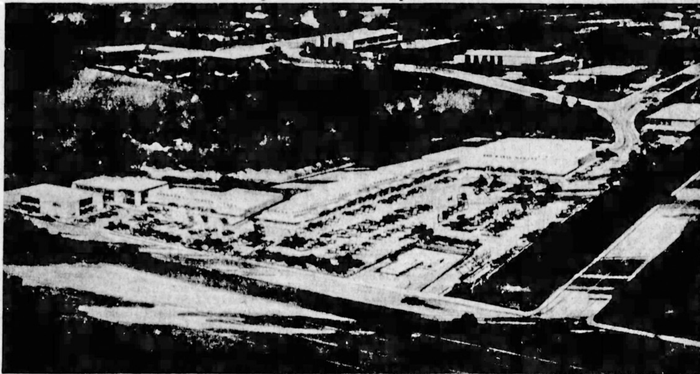
EUREKA SQUARE: This is the architect's drawing of the new Eureka Square shopping

center in Sharp Park, under construction. Apartments in rear are scheduled for construction.