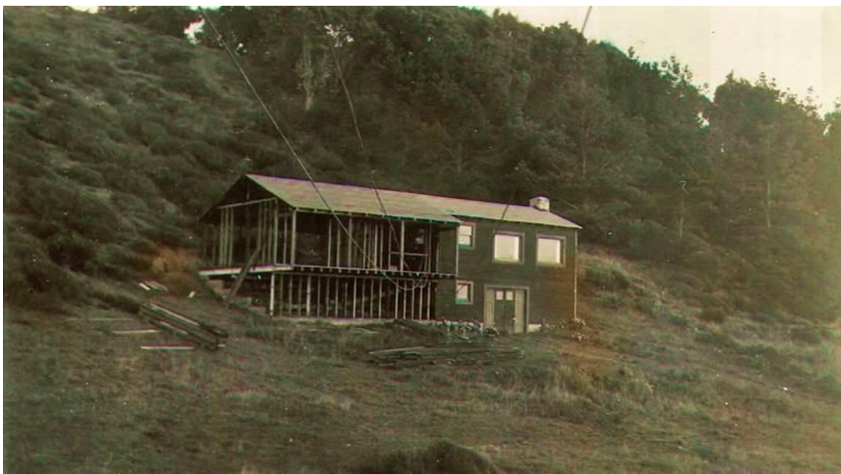
Shamrock Shack, a work in progress. The area right of the addition is the original 700-square-foot living space.

"I dug 10 wheelbarrow loads for the original garage; carried pails full of rocks for drainage – thus learning how big a cubic yard is; held iron pipe as hot lead was poured (there were complaints that I was not steady nor vertical!); mixed mortar for the stone fireplace; did undercoats of paint and stainings; helped a little with roofing but was poor where height was involved; fitted nail holes; ran errands; cooked in the fireplace till the kitchen was ready; and furnished constant admiration!"