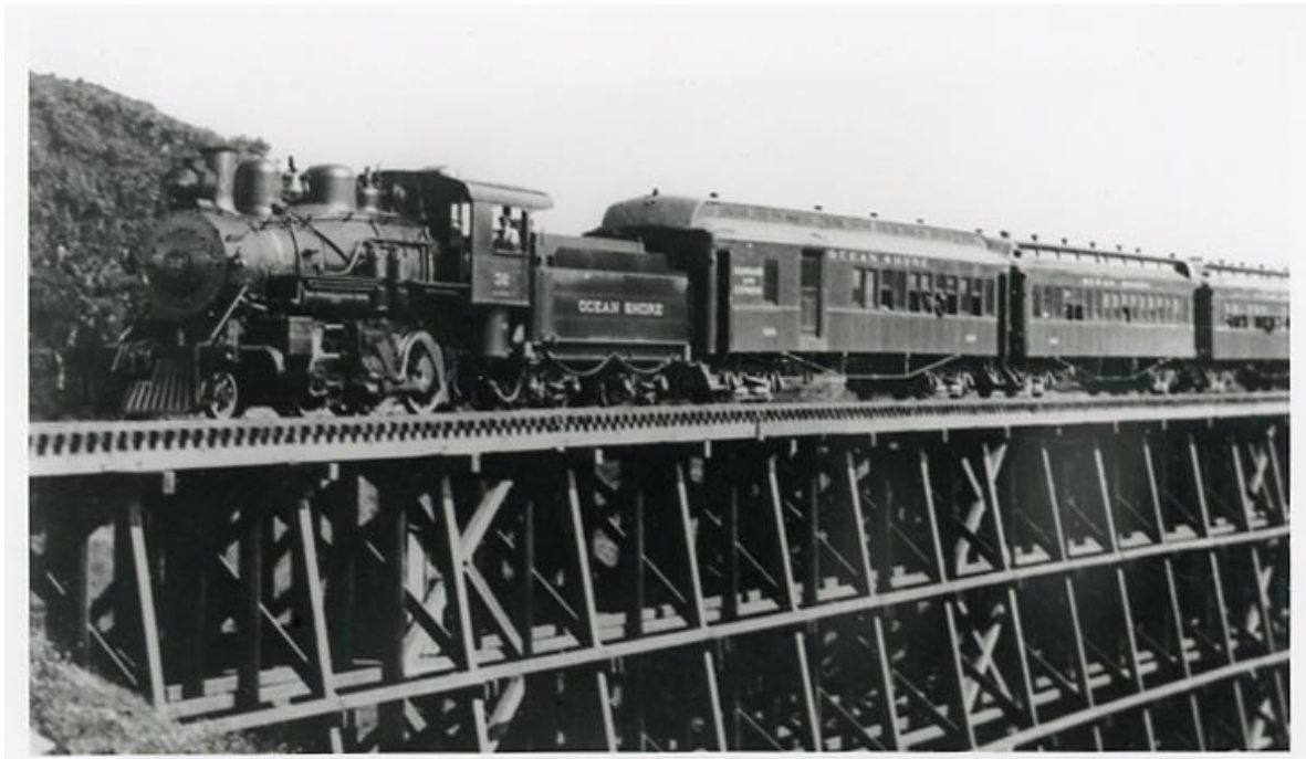
The Ocean Shore Railroad steams along a coastside trestle, somewhere between 1908 and 1920. The railroad ceased operations in 1920.

"The Laguna Salada was named after an arm of the sea that came in and covered a good part of what is now the Sharp Park Golf Course," Bob recalled. "Down by the lagoon, they placed a bathing pavilion. Decks reached out to the water, and bath houses (along today's Clarendon Road) covered the area. Many people took advantage of it, including the boys from San Francisco."