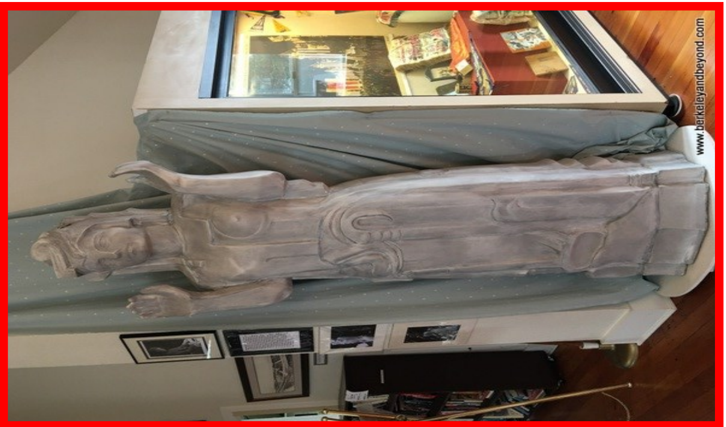
Goddess Pacifica, the Goddess of Peace - Displayed at the Coastside Museum