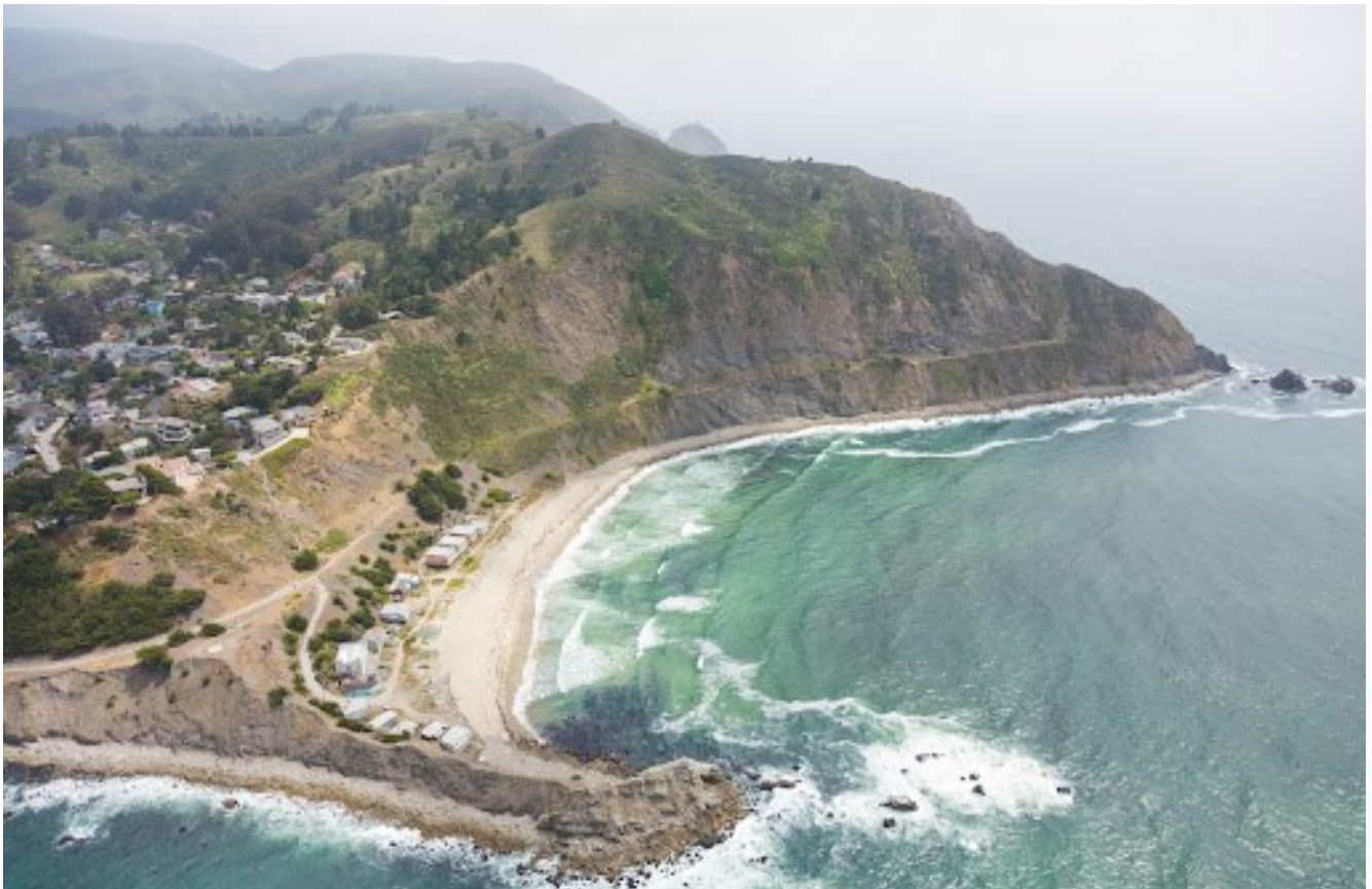
Historic Shelter Cove and Pedro Point