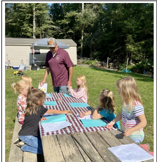
Children conducted an extensive scavenger hunt, learned about campfire safety, and worked on wildlife coloring books.