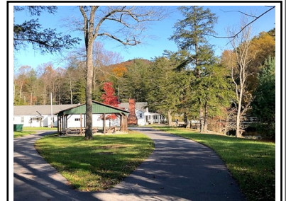
Sieg Conference Center Centre Driveway. September 2024.