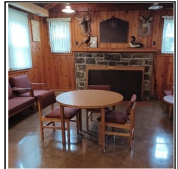
Main Lobby Sieg Conf. Center September 2024.

A walkthrough of the SCC was held in September. Several parties have shown interest. As the owner of the building at the SCC, the Commonwealth of Pennsylvania is the primary owner. They remain the primary negotiating entity for agreement and sale.