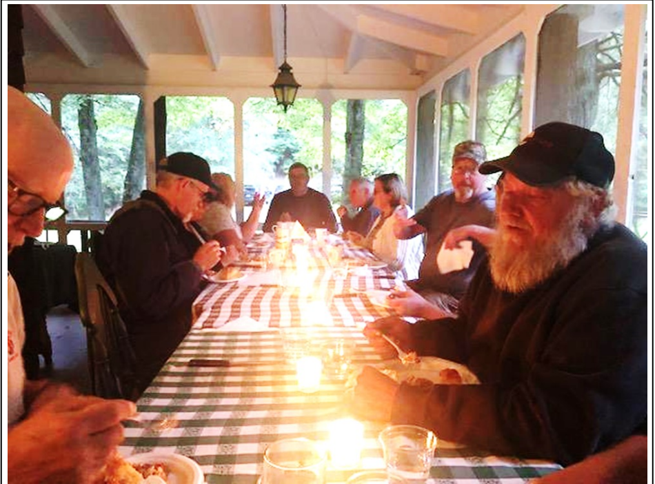
Members of the BFCCA and Sugar Valley Watershed Association at Big Pine Lodge in the Narrows. September 9, 2024.

For the second consecutive year, BFCCA and the Sugar Valley Water Association (SVWA) members met. Thirteen participants provided updates and discussed common issues. A blownout mountain artesian well on Summer Road, staffing at the Clinton County Conservation District, the Sieg Conference Center, upstream special fishing regulations, stream habitat improvements and coordination with agencies including National Trout Unlimited were discussed. The entrée, three ice cream selections and homemade pies were alone a reason to attend.