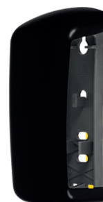
Modern Black E102102