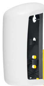
Clean White E102101