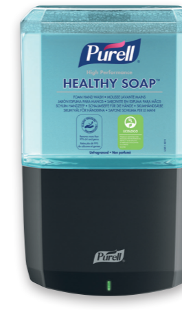
PURELL ES6 TOUCH-FREE

Durable and reliable manual systems. Easy to maintain.