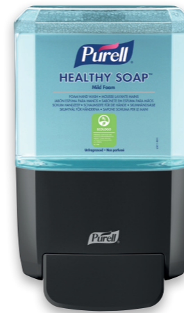
PURELL ES4 MANUAL

Durable and reliable manual systems. Easy to maintain.