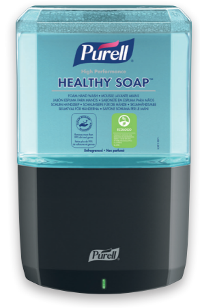
PURELL ES8 TOUCH-FREE, ENERGY-ON-THE-REFILL AND SMARTLINK™ CAPABILITY

Touch-free systems built for reliable performance and maintenance ease.