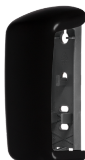
MODERN BLACK E102102