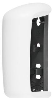
CLEAN WHITE E102101