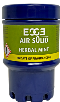
HERBAL MINT E102202