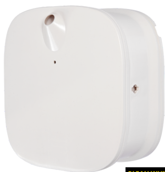
CLEAN WHITE E105101