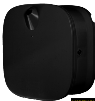
MODERN BLACK E105102