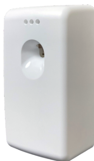
CLEAN WHITE E110101