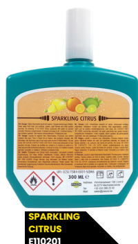
SPARKLING CITRUS E110201