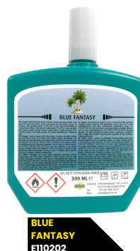
BLUE FANTASY E110202