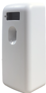
CLEAN WHITE E111101