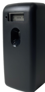
MODERN BLACK E111102