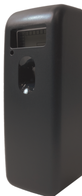
MODERN BLACK E121102