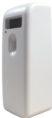
CLEAN WHITE E121101