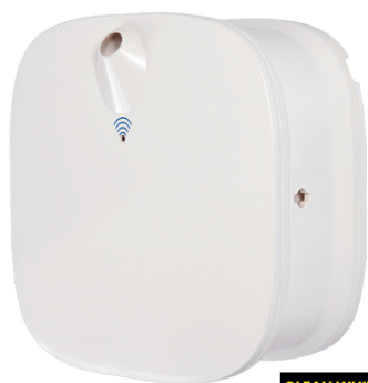
CLEAN WHITE E105111