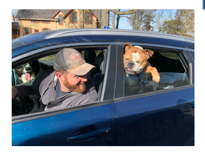
Tilly Fuzzy Representative