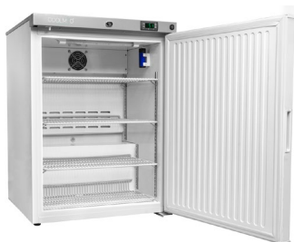
CMS125 Medium Solid Door Refrigerator