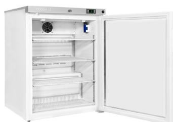
CMG125 Medium Glass Door Refrigerator