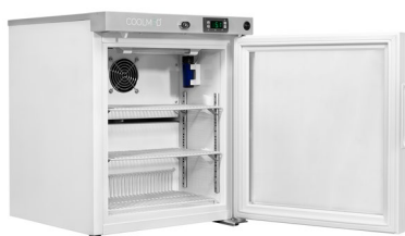
CMG29 Small Glass Door Refrigerator