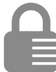
COMBI01 Keyless Combination Lock