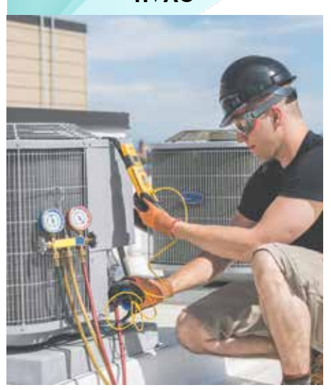
Heating and Air Conditioning Technology

Discover the principles of basic refrigeration and heat theory, read and understand basic wiring schematics, and test, diagnose, and service residential-sized air conditioning units. You will study automatic and electrical controls for heating equipment, including electric heat, gas furnaces, and heat pumps. This course includes classroom instruction and shop time.