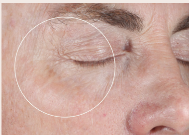
15 MINUTES AFTER FIRST APPLICATION