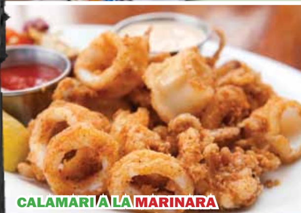
CALAMARI A LA MARINARA