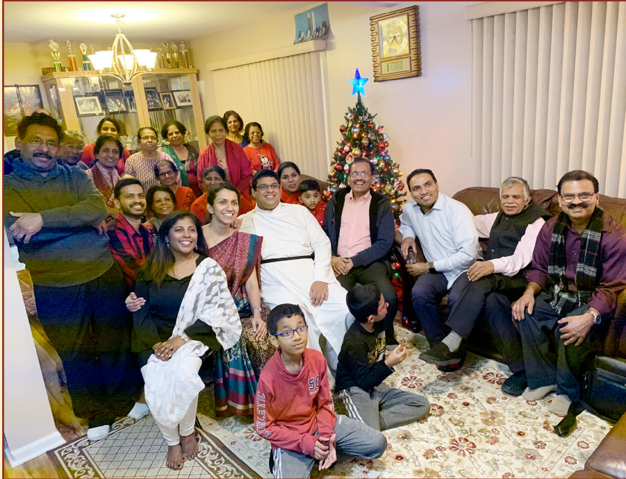
Hylan Blvd./NJ Prayer at Christmas Fellowship Get-together