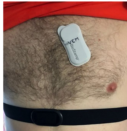
Fig. 1. BioStamp nPoint ® and Polar chest strap positions on a study participant.

In addition to the biosensor itself, there are significant technological and operational barriers to real-time data monitoring in professional athletic venues. While a few studies have examined in-game HR response during elite athletic competition, to our knowledge extremely few have been conducted among professionals during competition and none have gathered and processed HR in real-time.