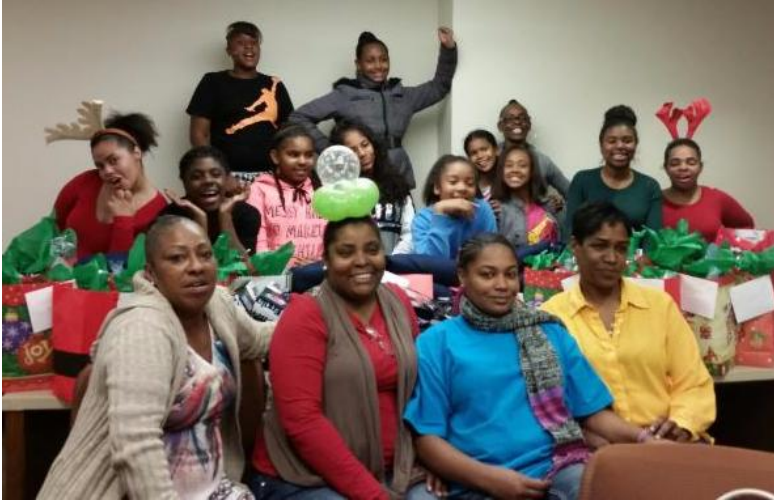
Smile All Around