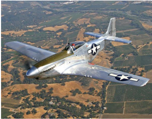
Picture 1. P-51 mustang in the air [1]..... Error! Bookmark not defined.