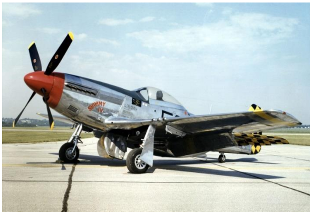
Picture 2. P-51 Mustang on the ground [2]..... Error! Bookmark not defined.