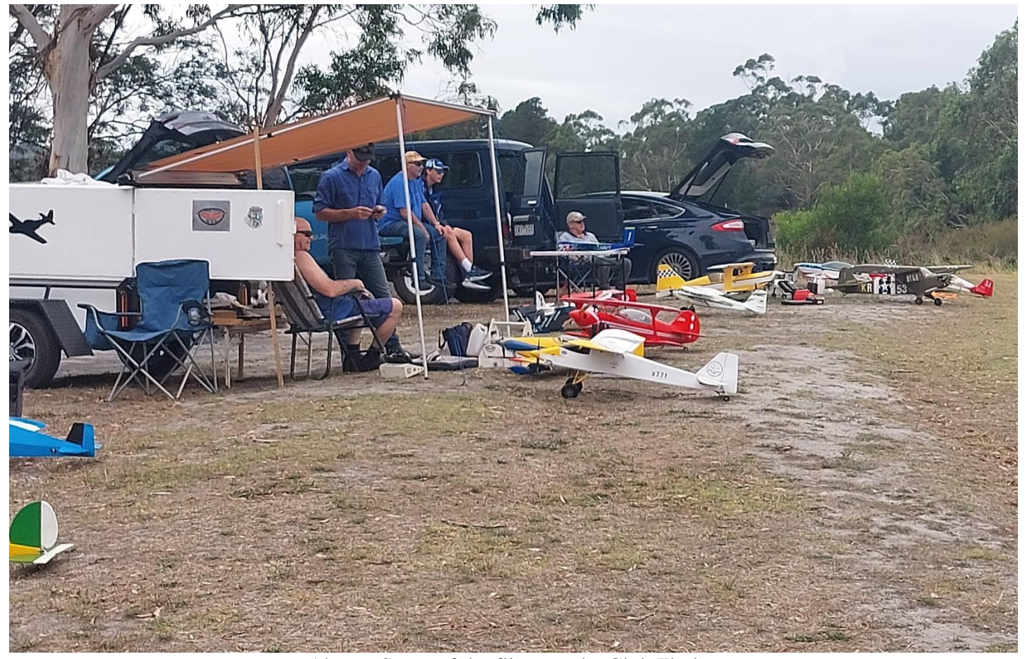
Above -Some of the fliers on the Club Flyday