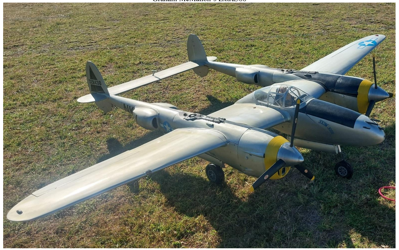
Above – a nice big P38 Lightning at the Bairnsdale Scale weekend