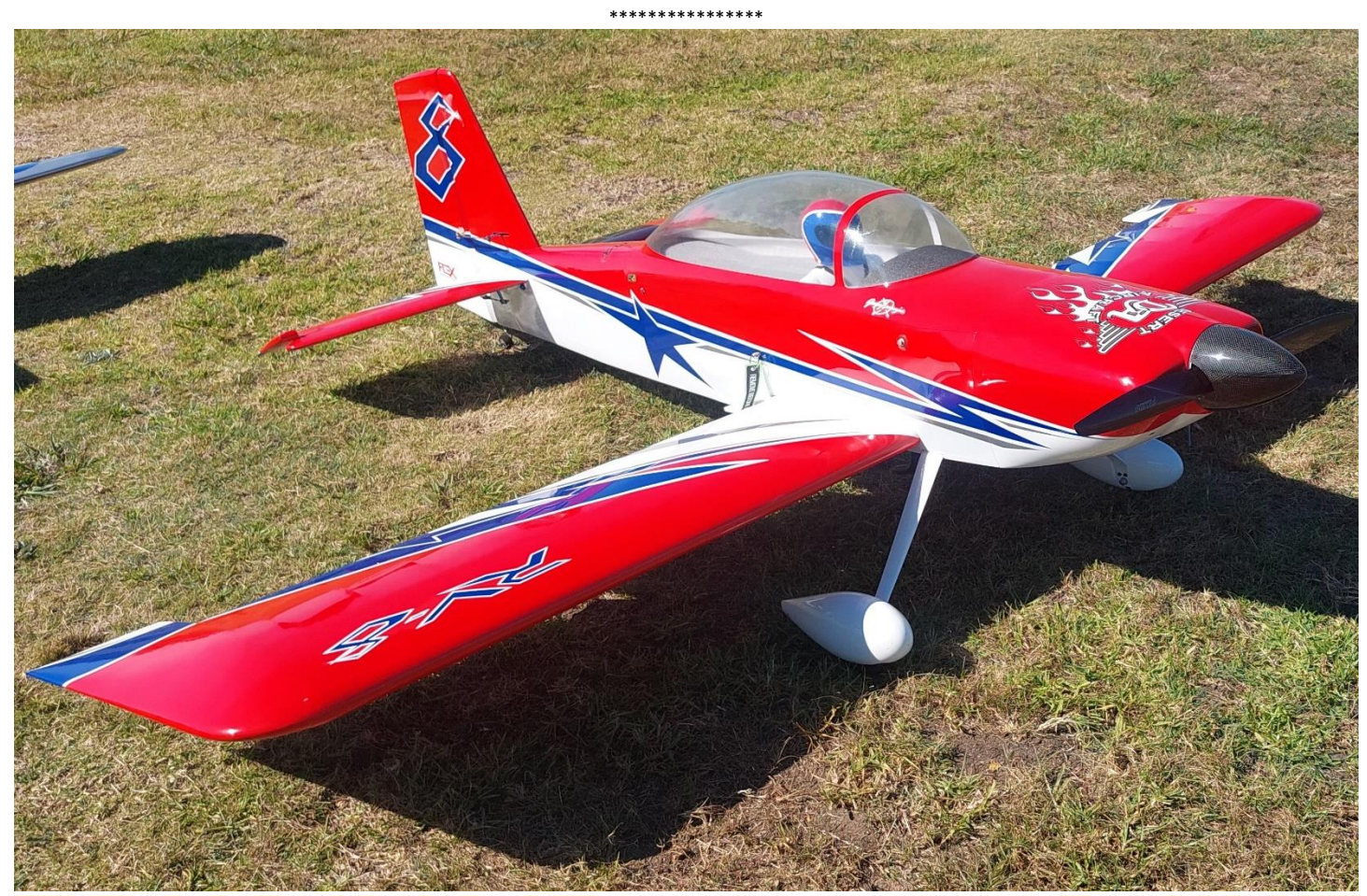
Above – a very nice large RV8 at the Bairnsdale Fly-in weekend