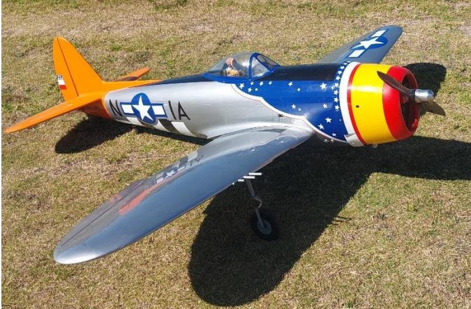
Above – pics of some very nice Models from the Bairnsdale Scale Fly-in