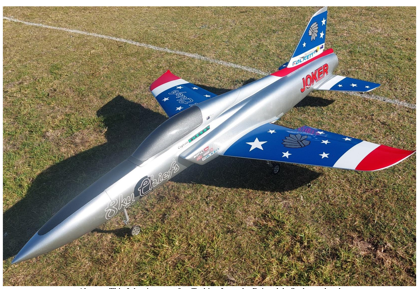
Above – This Joker is a very fast Turbine Jet at the Bairnsdale Scale weekend

General Flying at Lake Narracan on Thursday, Saturday & Sunday mornings when the weather allows.