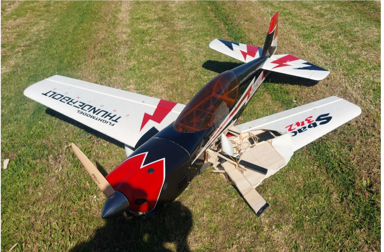
Above & below – Ian P had a few bad days this month