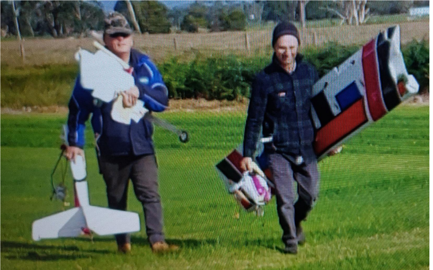
Above – Mick’s 50cc Wot 4 went off the air and crashed – cause - a screw through a switch harness lead.

http://www.maaa.asn.au/images/pdfs/forms/Form-016-POWER-BRONZE-SILVER-WINGS.pdf