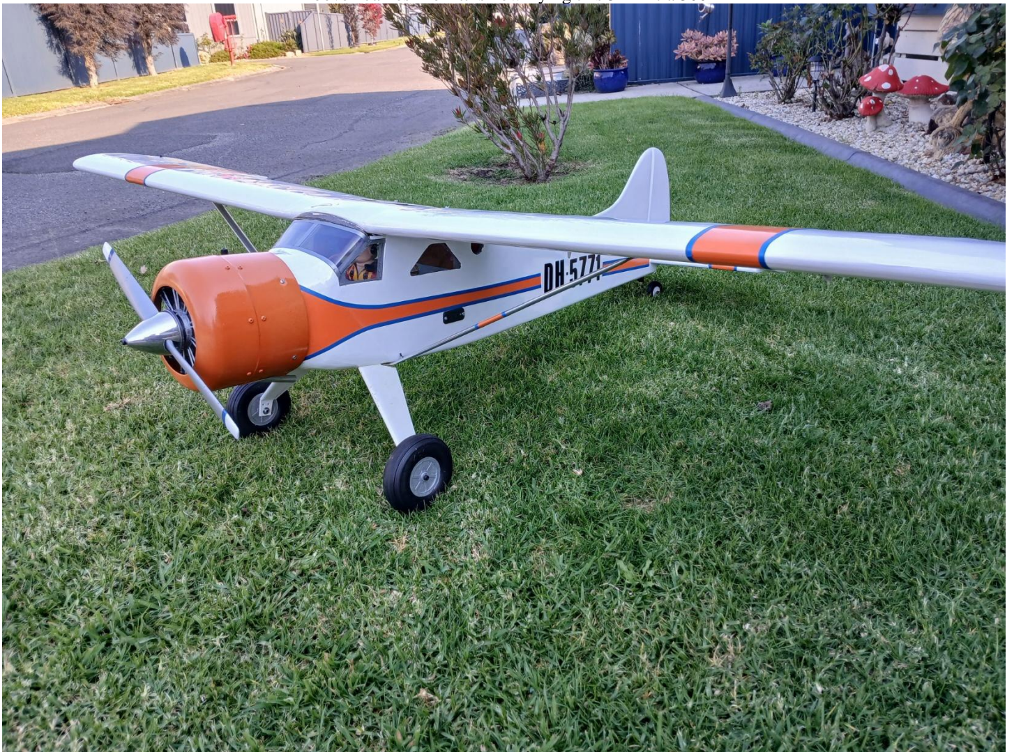
Above – Rex Mitchell’s scratch built DHC Beaver is almost ready to fly. I’m sure Rex will really enjoy flying a Scale Model without a retractable undercarriage !