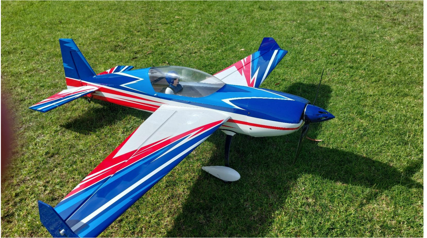
Above - James Morfitt is now flying this 3D Extra 300