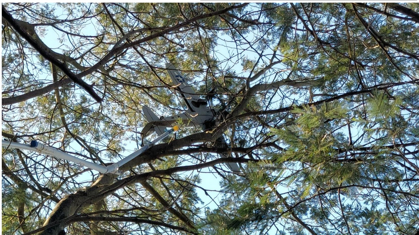
Above – Wayne's P40 Warhawk found its way into a tree – cause was only 1 underwing flap was down on take off – no damage