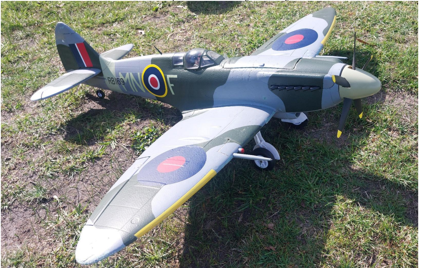
Above – Graham McMahon’s Spitfire

Round 1 of the Combat Classic will be on Sunday 3 rd May 2026 at 11.00am if the weather permits. (or 12 Midday if the grass is too wet at 11am)