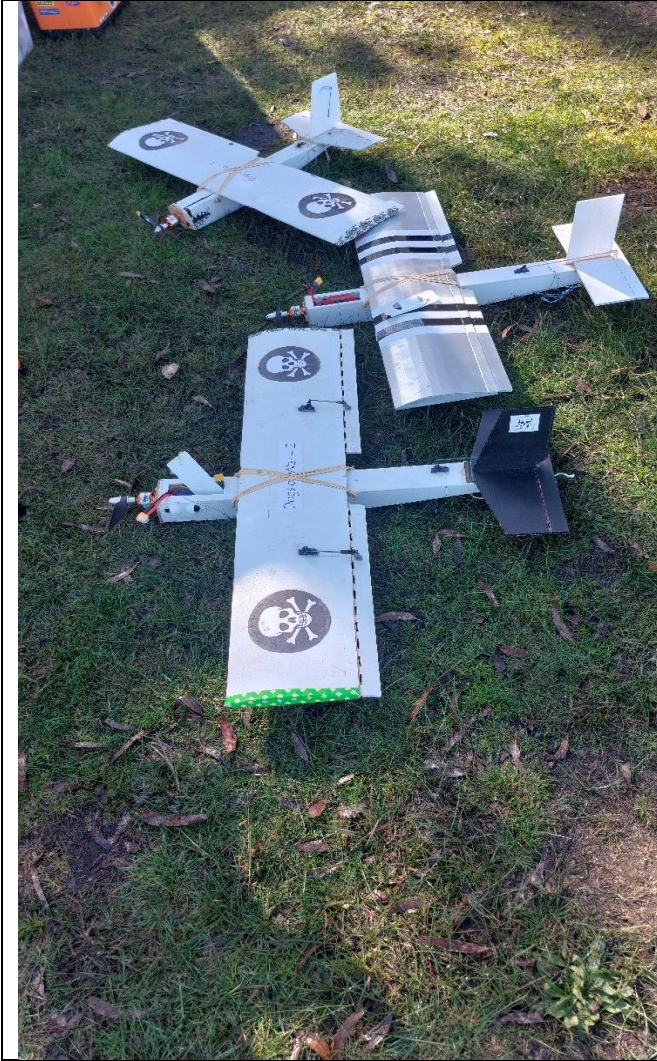
Above – Brian’s Combat line up