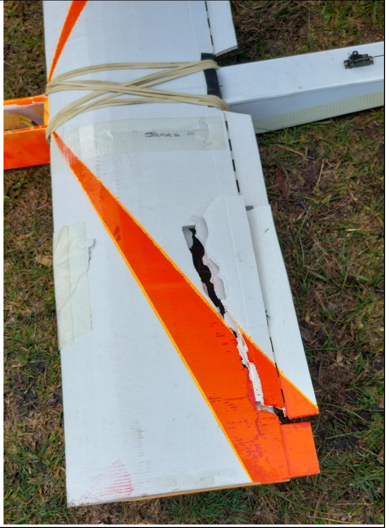
Above – Wayne’s Wing

Always make sure you have a phone with you so that you can make or receive a call if you need to go into the paddocks and wear appropriate footwear.