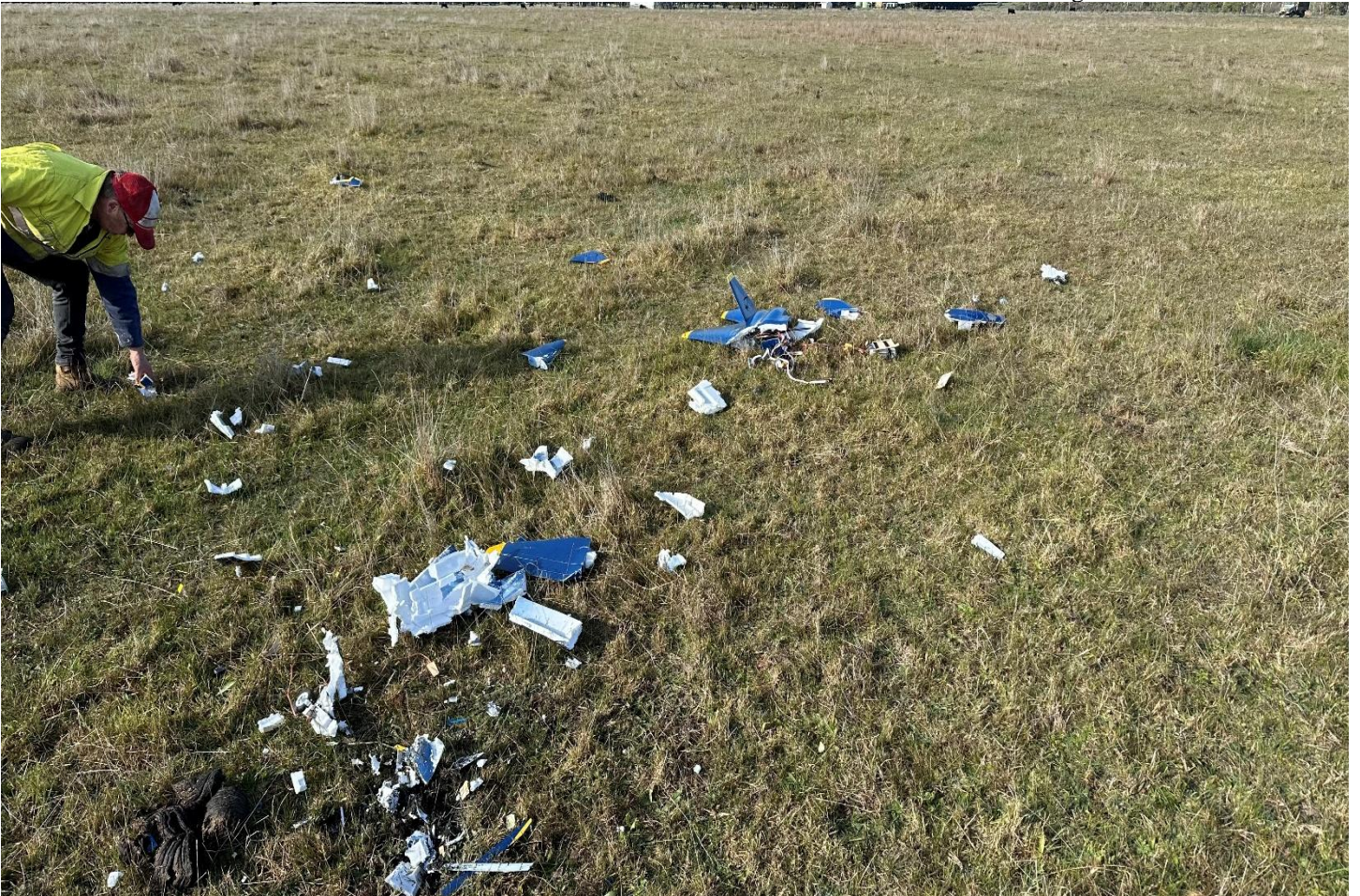
Above – Craigs F22 Raptor went off the air and straight into the ground. Not much to salvage ! Even killed the motor !