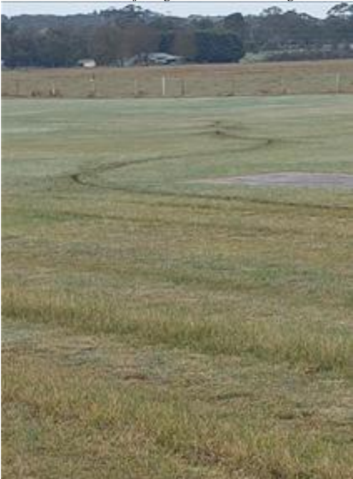
Above – some mongrel has been riding a Motor Bike on our strip. We are not impressed !