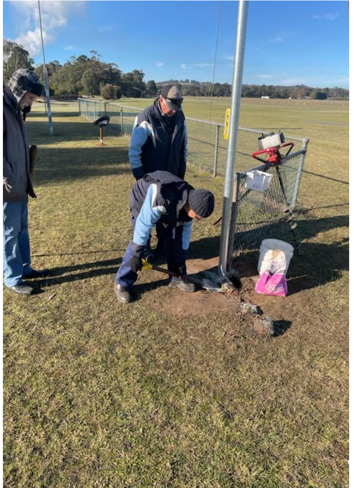
above- filling in the base of the new 6m pole