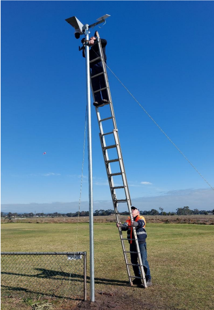
Above – Godwin adjusting the fixed Camera Angle