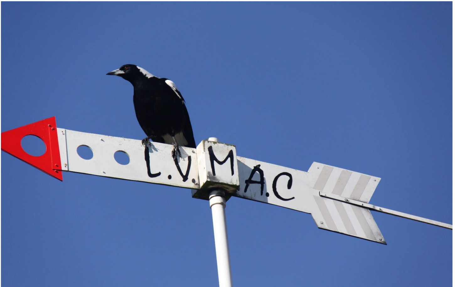
There is always something keeping an eye on us at Lak Narracan