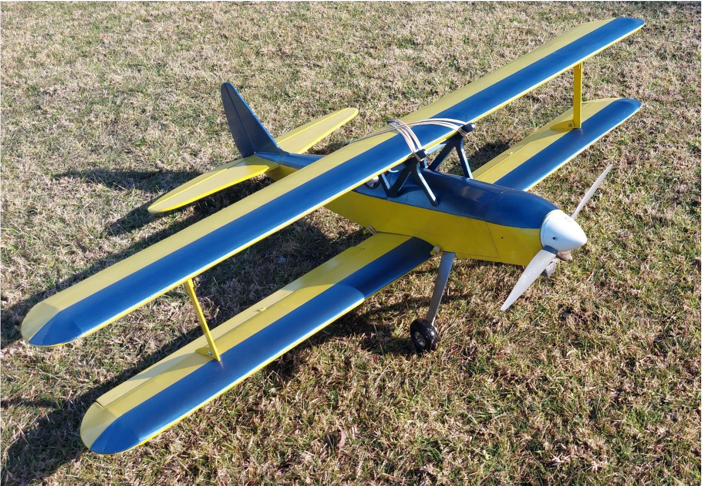
Above – Godwin has built this Wayfarer, powered by a .90 4Stroke. Fly's well. Several other members are also building them