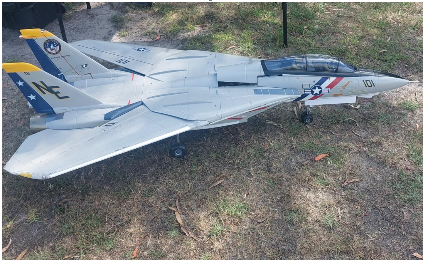
Above – Craig has a new F14 Tomcat EDF with swing wings – It seems to fly nicely