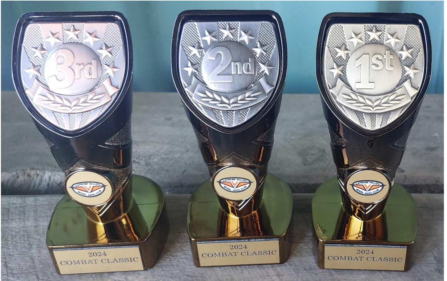
Above – The Combat Classic Trophies