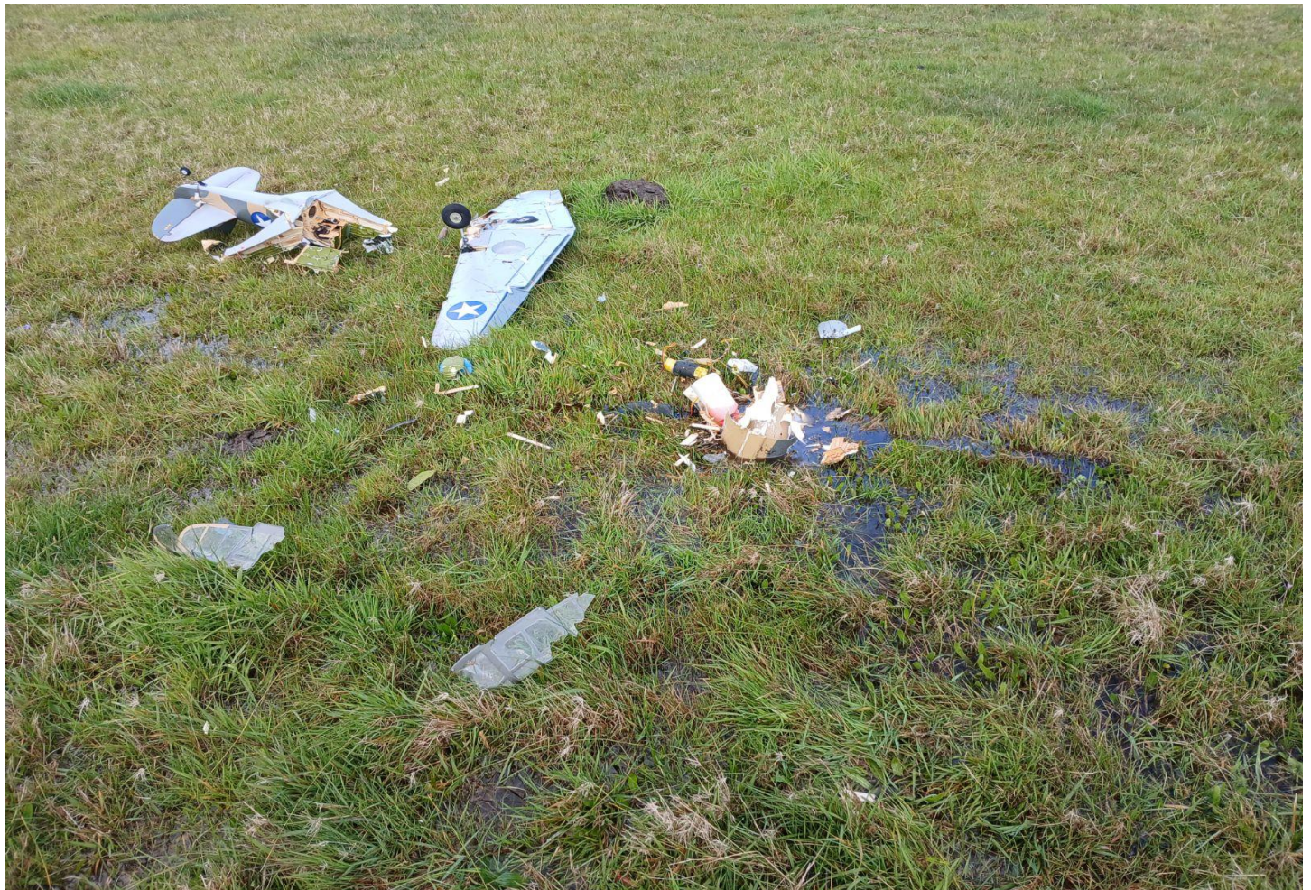
Above – the Warhawk crash site

We did manage to get 1 good flying day in this Month. The forecast wasn’t good but it turned out that the forecast was wrong on Sunday September 15th. There was a good roll up of members and quite a bit of flying. Unfortunately, Rex lost his new Warhawk when it went off the air and crashed out in the paddock to the South West. The OS120AX 2stroke motor had to be dug out of the wet ground. Rex had only just repaired it from the maiden flight crash (with reversed ailerons and he thinks he may have been on the wrong model in his Tx) The same happened to his Corby Starlett.