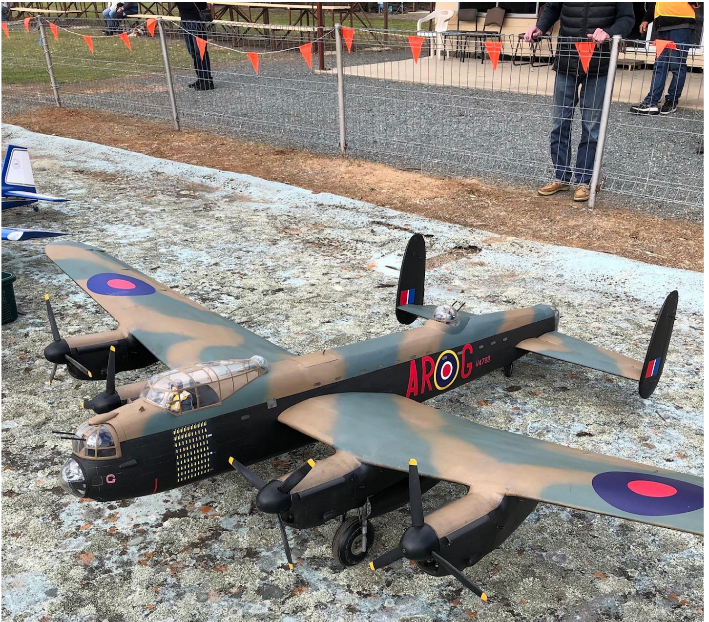
Above - a nice Lancaster at Shepparton Mammoth Scale

Many thanks to those who have contributed to the newsletter with Articles, Pictures and information this month. It would be good to get some new contributors. Thanks also to our regular contributors in particular for their monthly contributions.