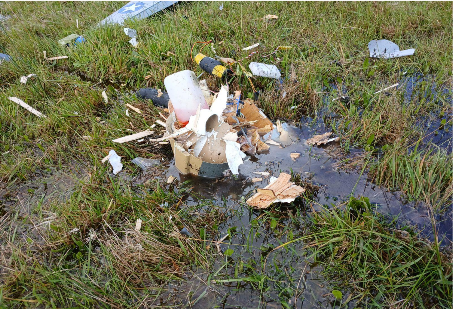
Above – the OS120AX engine had to be dug out