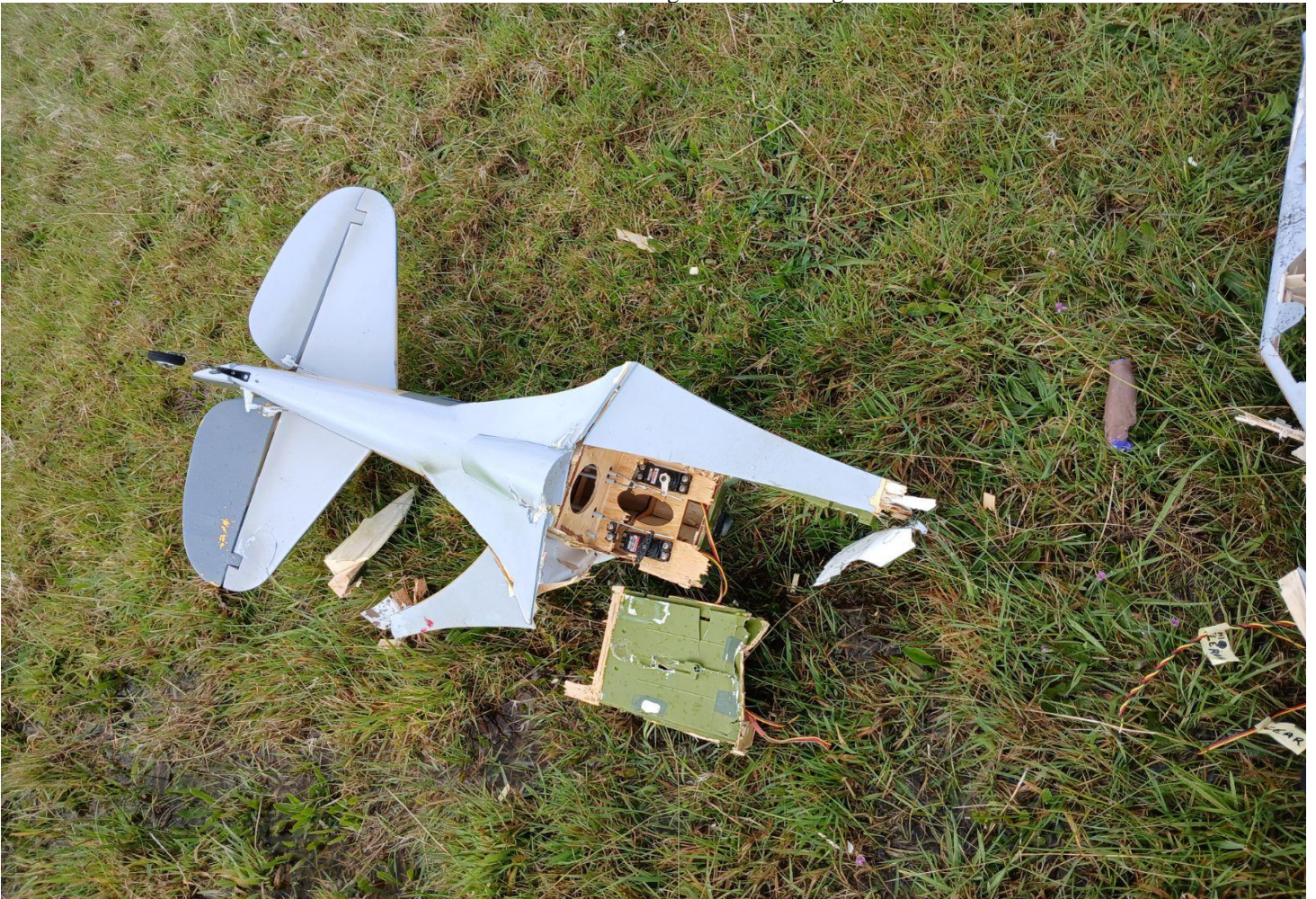
Not a pretty site for a new Warbird but we all know it happens