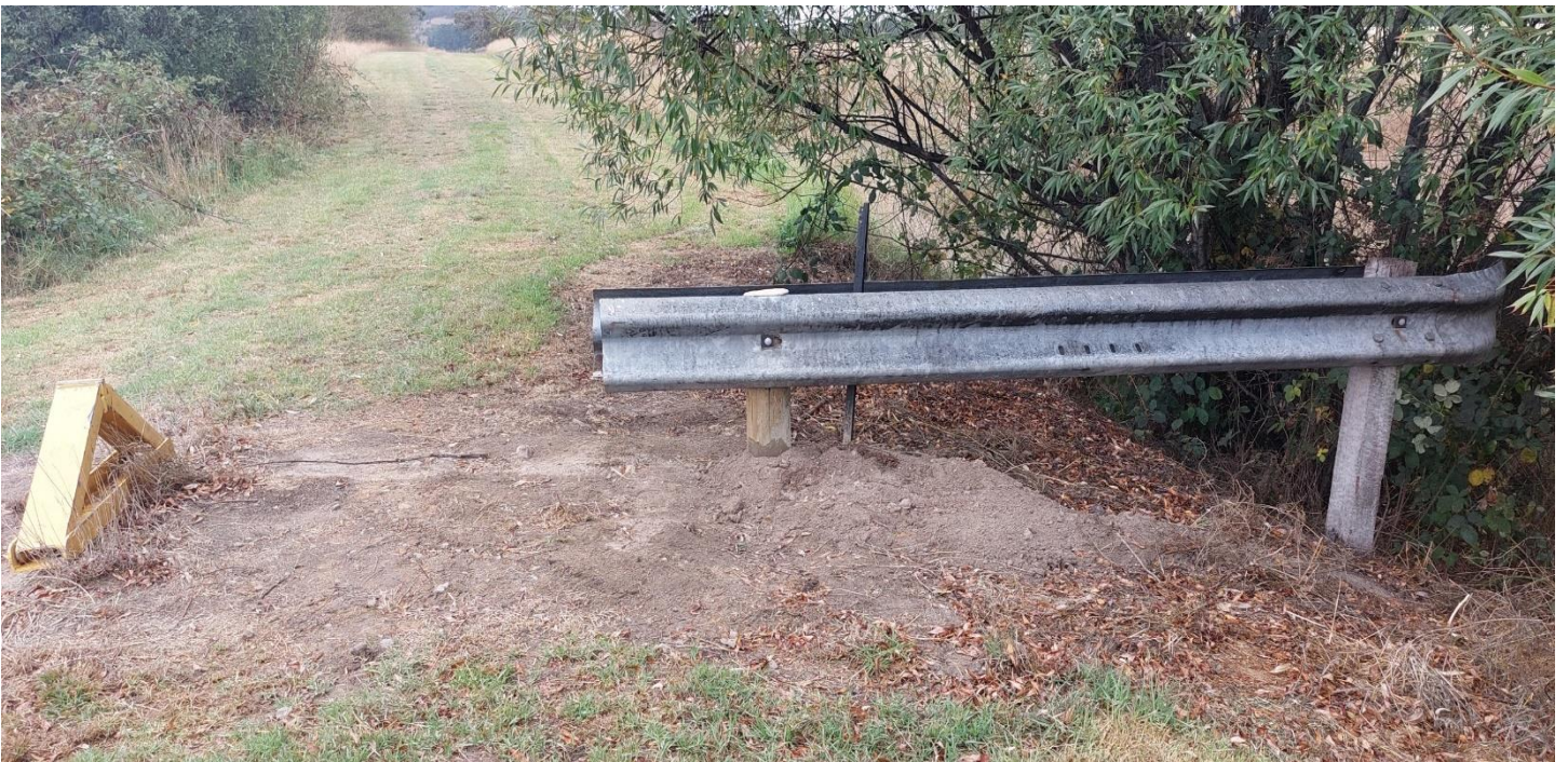
Above – the entrance at the Western end. We had to put in a new post as the old one had rotted off at the bottom and some fishermen were pulling the fence aside and driving into our area.

Don't forget the Combat Cup will be on Sunday March 16 th at 10.00am if the weather is suitable