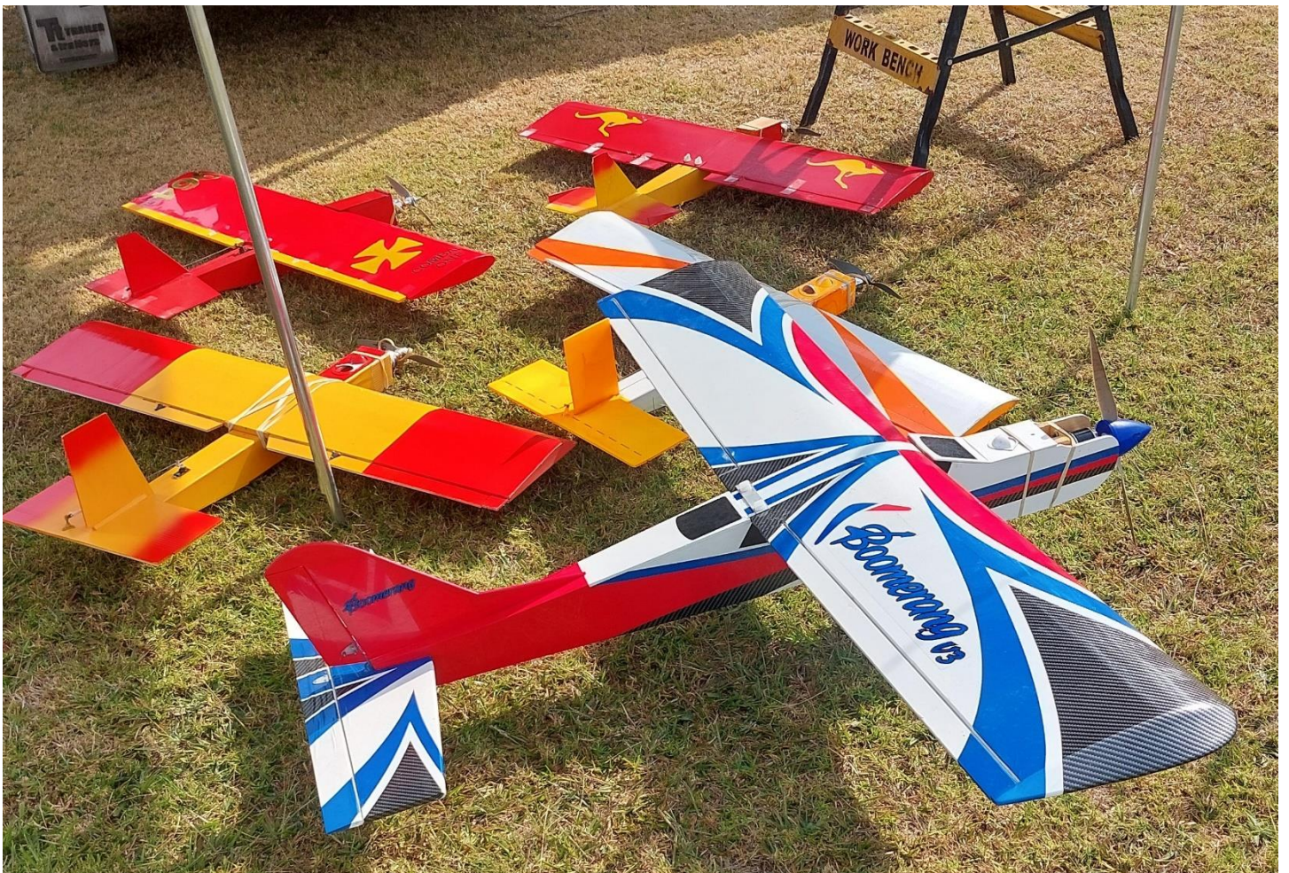
Above – Wayne's collection for the day