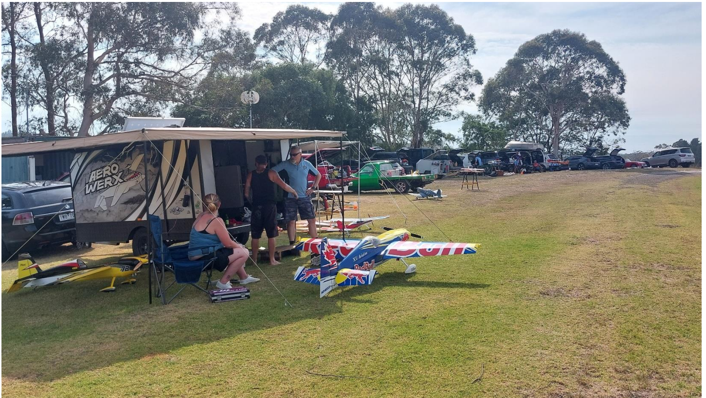
Above – a good roll up on one of those hot days

Don't forget to Slip, Slop & Slap and seek shade