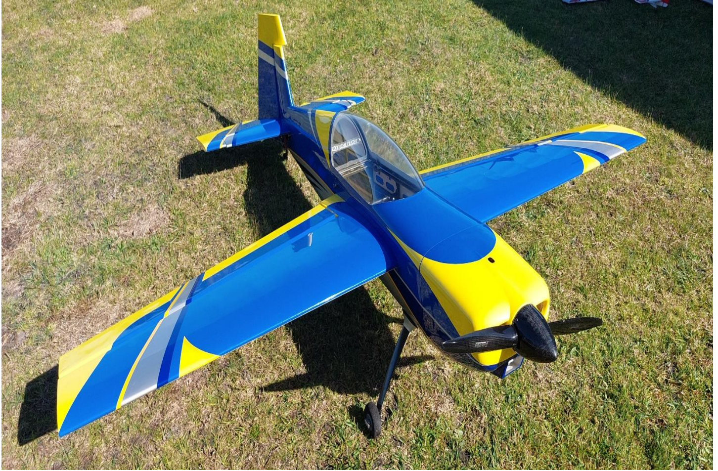
Above - Jamie McLaughlin now has this nice Edge 540 30cc DA engine

http://u.b5z.net/i/u/10194601/f/Flight_Intruc/Part 5 5 -Description_of_Gold_Wings_Manoeuvres.pdf (read in conjunction with the MAAA Bronze, Silver & gold Wings Sheet as there are manoeuvres that we do not do, included in this pdf )