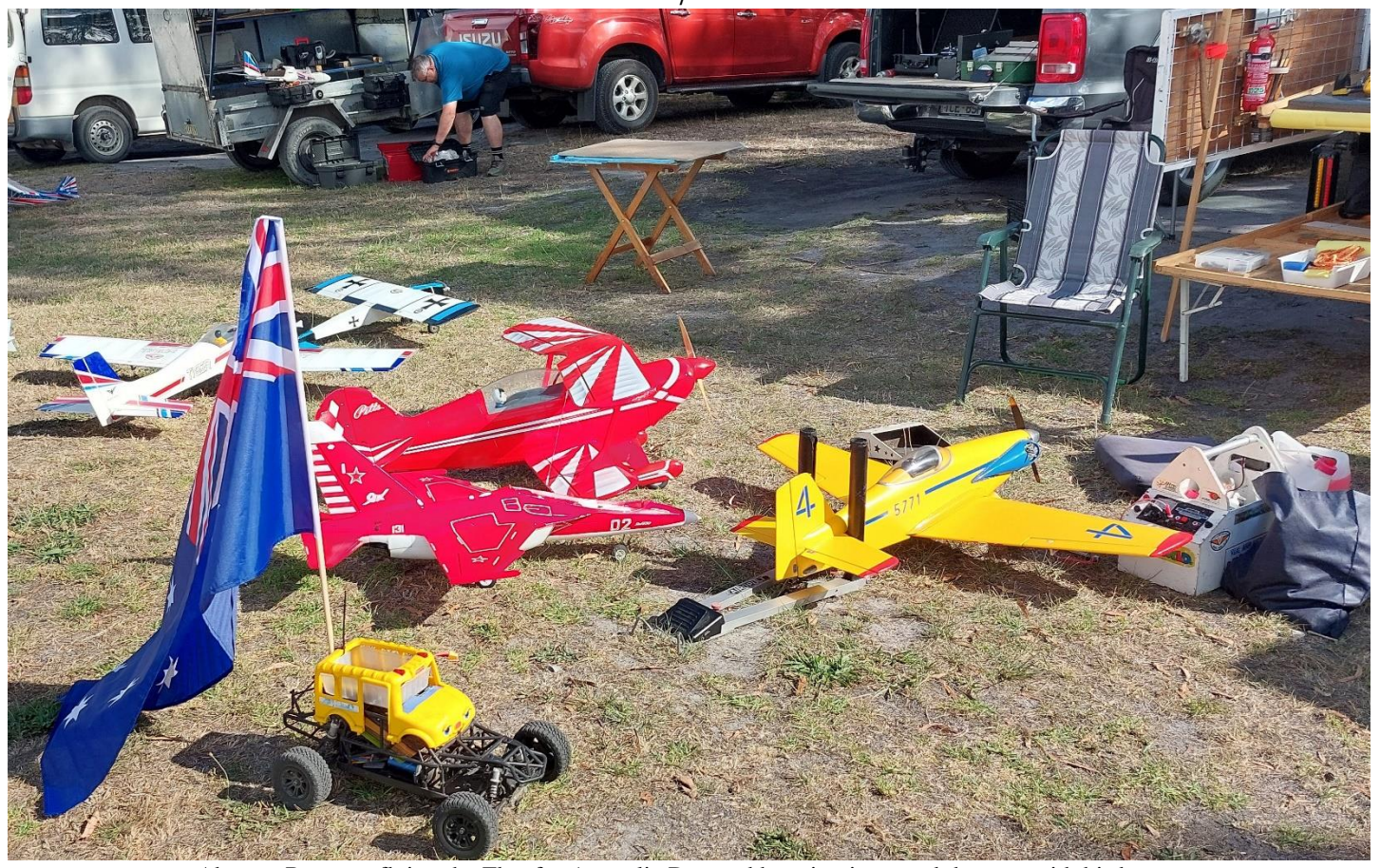
Above - Rex was flying the Flag for Australia Day and hooning it around the area with his buggy