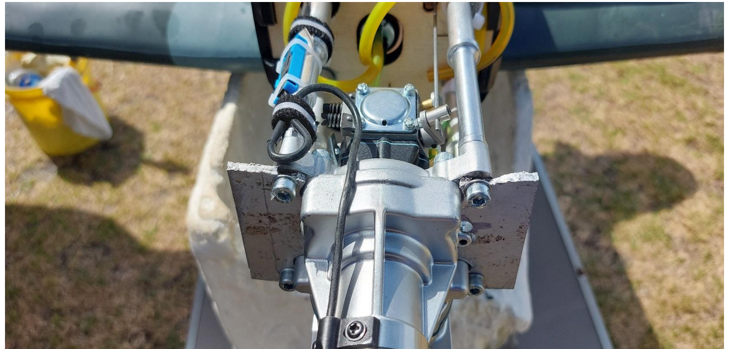
Above -Glen Neals changed his Spitfire from electric to a Petrol Engine and on the test flight (without the cowl on) part of the motor mount broke off which had lead weight to balance the model and the model became extremely tail heavy and was porpoising up and down. After several attempts and some luck, the model was landed safely.