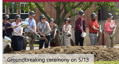
Groundbreaking ceremony on 5/13

Work on the original Harry Weese portion of the building has begun! Interior demolition will start on the north side of the building, where all three floors will be simultaneously renovated. Work will occur concurrently to demolish the existing pool and turn it into a large group instruction space. Construction is expected to conclude in summer 2027.