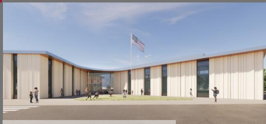
Rendering of new main entrance