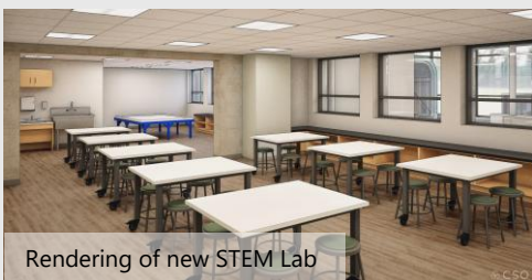
Rendering of new STEM Lab

Construction is underway at Smith Elementary! A groundbreaking event was held on May 12 to commemorate the onset of site work and celebrate the many hours put in by the teacher design team. Summer work will be focused on the cafeteria, Pre-K classrooms, and the planned additions.