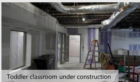
Toddler classroom under construction

New drywall, tiling, and flooring have been installed at the Johnson EEC. Throughout summer 2025, work will continue on all remaining classrooms in the building. The space will become the new home for Bright Beginnings starting in August!