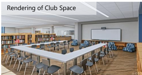
Rendering of Club Space

A new wellness area, new Maker Space, and updated media center are slated to open for the upcoming school year. The media center will have three defined zones: one for direct instruction, one for club activities, and the rest for library stacks and study space. Work is anticipated to complete during Fall Break 2025.