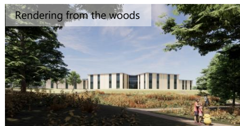
Rendering from the woods

Grade-level classrooms, including Pre-K, will be clustered near each other and open onto a series of shared learning commons. Each classroom has a direct view to the outdoors for a connection to the natural surroundings and has interior adjacencies to specialized staff, including therapists, counselors, and an SRO.