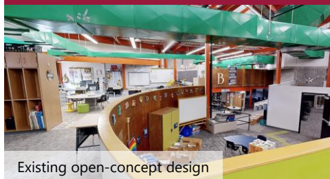
Existing open-concept design

CORE Construction has been brought on as the construction manager at Mt. Healthy. They, along with the architecture and engineering teams, will be working on the design of the building's interior over the summer. Construction is scheduled to begin in early spring 2026.