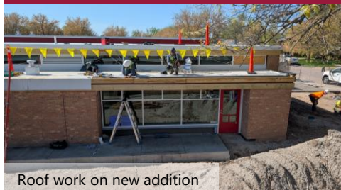
Roof work on new addition

Work continues on the new addition at Schmitt Elementary! The addition includes three new classrooms for kindergarten/first grade. Each of the new classrooms has ample daylight, access to a courtyard, and its own restroom. The addition was designed to honor the original 1957 Harry Weese portion of the building.