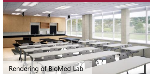
Rendering of BioMed Lab

A new biomedical lab will be created this summer at Columbus North. The space will be open for student use at the beginning of the 2025-2026 school year. It will match an existing lab space and allow expanded enrollment options.