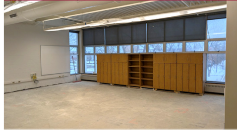
Second floor classroom under construction

Second floor classroom renovations are almost complete! Classrooms have received new casework, plumbing fixtures, and paint. New carpet and instructional technology will be installed by the end of February so that the classrooms can be returned to students after Spring Break. Following the completion of the second floor rooms, only one phase will remain. Phase eight will address remaining classroom spaces and related arts classrooms. Construction remains on schedule and will be complete for the start of the 2026-2027 school year.