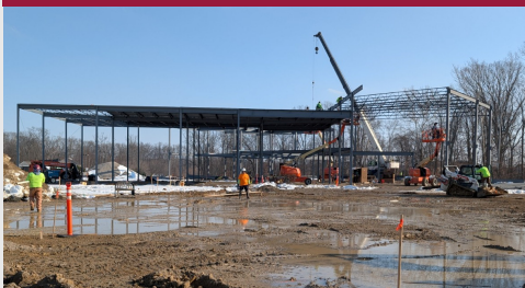
Steel at the main building entrance and offices

Steel construction has commenced at Maple Grove Elementary. Despite frigid temperatures, the Pepper Construction and Taylor Brothers Construction teams have maintained the schedule on site. Framing is starting at the main office and will continue to move south on the site for several months before the new precast concrete walls arrive. Once the entire building is framed and the exterior walls have been added, crews will move to the inside of the building to begin putting up walls for all classrooms and support spaces. Maple Grove is scheduled to open its doors for students in August 2027.