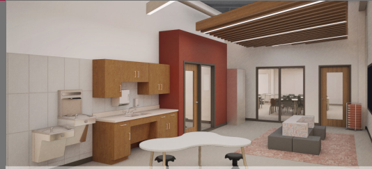
Rendering of commons and classroom