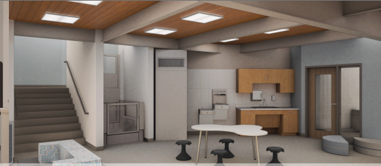
Rendering of commons, stairs, and lift