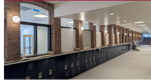
Renovated first-floor corridor

Finishing touches are going in at the first phase of the Northside renovation. New student lockers have been installed to line the corridors and match the marching cadence of the existing brick columns and light fixtures. Natural light pours in from the north-facing windows allowing students to visually connect with the outdoors from as many points in the building as possible. New stairs at the end of each of the corridors have been recently installed and provide improved connection between all three floors. The project is scheduled to be complete in summer 2027.