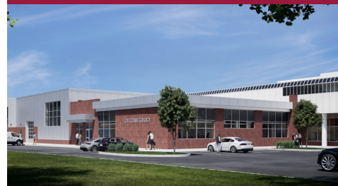
Rendering of cosmetology spaces

As one project nears completion at Columbus East, a new project begins! The second-floor renovation supporting the Health Sciences Pathway is almost finished with construction and will be receiving furniture and equipment installs in late February and early March. Maxwell Construction will then shift gears to begin onsite work for a new addition on the west side of the building. The addition is roughly 22,500 square feet and will break ground around Spring Break. The new addition is designed to blend with the existing building and will support construction, welding, agriculture, and cosmetology courses. It is projected to be complete for the start of the 2027-2028 school year.