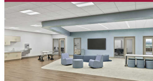
Rendering of commons and classrooms

Construction documents are ongoing for Taylorsville. The design captures and reuses most existing classroom spaces, in addition to a heavy renovation of the core of the building to create improved student and staff support spaces, including new sensory rooms, teacher work rooms, and grade-level learning commons. New, flexible furniture will outfit these spaces, allowing groups of various sizes to meet for collaboration. Additionally, as part of the renovation, the main office will be relocated from the center of the building to face Walnut Street to improve sightlines and enhance safety and security. Construction is slated to start in summer 2026.