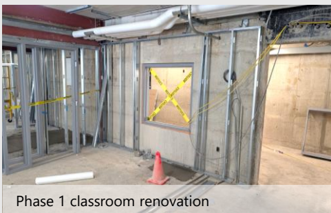
Phase 1 classroom renovation

As summer work in the cafeteria and pre-K classroom concludes, work on Phase 1 classroom renovations continues. Scheduled to be complete by Fall Break 2025, the updated classrooms will each have an individual restroom, access to a small-group room and learning commons, and visibility to the corridor (shown below). The remaining seven phases of work are scheduled to conclude in August 2027.