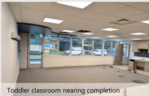
Toddler classroom nearing completion

Work is almost complete at Johnson. Six new classrooms and several support spaces will be opening in August 2025 to welcome the district's youngest learners. The classrooms match what was done in the first phase of work and have all new casework, finishes, and furniture. Students in these rooms will also have access to the new playground, completed earlier this year.