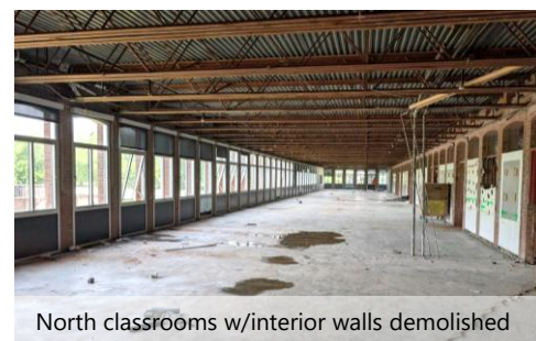
North classrooms w/interior walls demolished

If you've driven past the Northside campus recently, you may have noticed a gaping hole in the side of the building! The old pool wall has been demolished and is serving as the main path for debris leaving the building. The first phases of work focus on renovation of all classrooms on the north side of the building and the room that will eventually become a large group space, replacing the old pool. The project is scheduled to be complete in summer 2027.