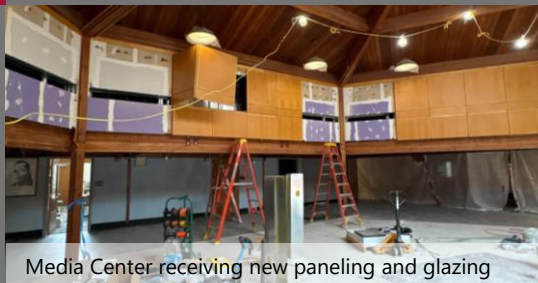
Media Center receiving new paneling and glazing