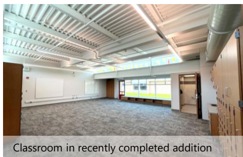
Classroom in recently completed addition

The new addition at Schmitt – designed to bridge the gap between the original Harry Weese building and the 1990s addition – features three classrooms, each with an individual restroom, ample daylight, and access to both learning commons and an outdoor courtyard. All classrooms also have new instructional technology and upgraded mechanical systems.