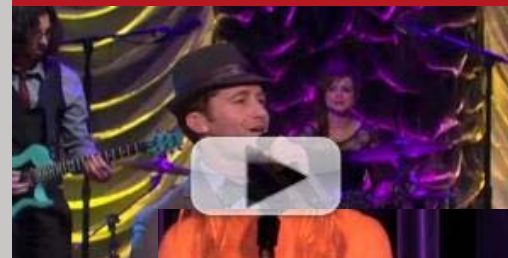
VIDEO: Matthew Morrison Performs 'Street Where You Live' on THE TALK