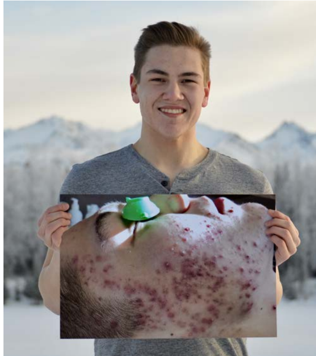
Certified, Face Reality Acne Specialist Elements Skin Care & Acne Clinic | Anchorage, Alaska