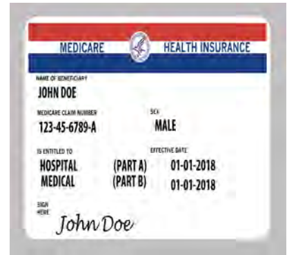
Class 301- Medicare CEMSA Plans