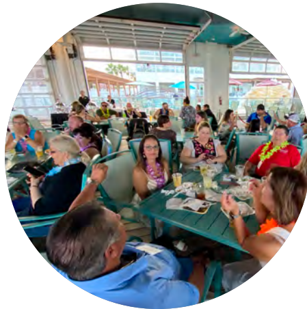
Post Cruise Happy Hour

Our theme for 2023 is, “Some Beach, Somewhere, SPI.”