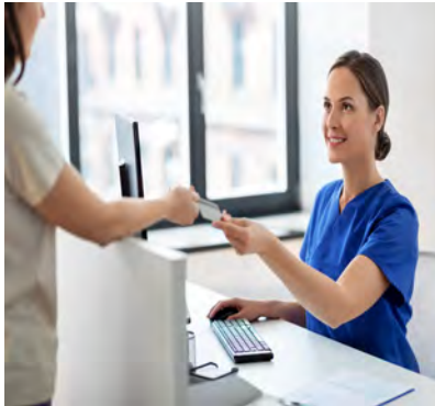
Class 201- Medicare Final Rule