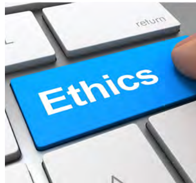
Class 501- Ethics Ethics vs Morals, You Decide By Ron Byrd Coures # 134990