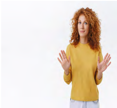
Class 101- It's Not Your Momma's Insurance Anymore

CE classes will cover Medicare, Ethics and Employee Benefits. We may even cover some Legislative issues.