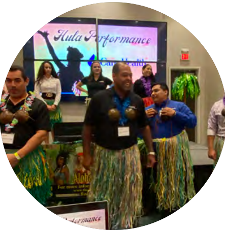
Mid-day Break Hula Dance Lessons