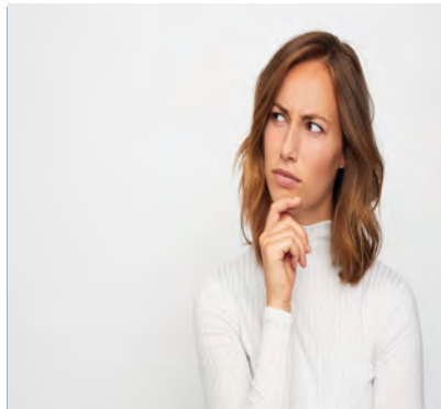
Class 401- MSA Plans