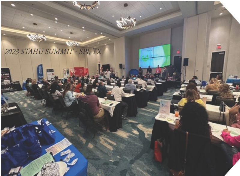
2023 STAHU SUMMIT - SPI, TX