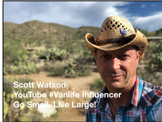
GoSmallLiveLarge.com • YouTube • Instagram