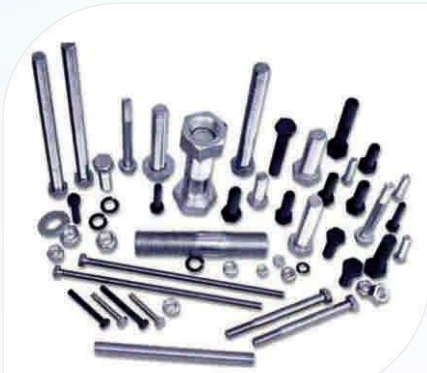
Oil & Lubricants

We offer a comprehensive range of industrial fasteners, including nuts, bolts, clamps, and tools, built for strength and precision. Engineered for heavy-duty performance, our products are available in a wide selection of standard and customized sizes to meet diverse industrial requirements.