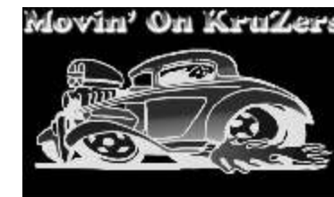
Hosted and Judged by Movin' On Kruzers www.movinonkruzers.com