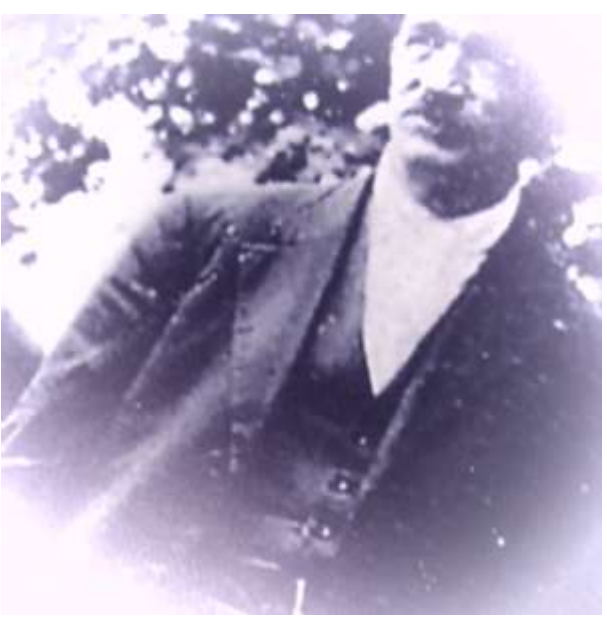
Photo of Waldemar Ager in 1905 by Daniel B. Nelson. Special Collections, UW-Eau Claire McIntyre Library.

Attendance at program following the banquet at approximately 7:45 is free. No tickets required.