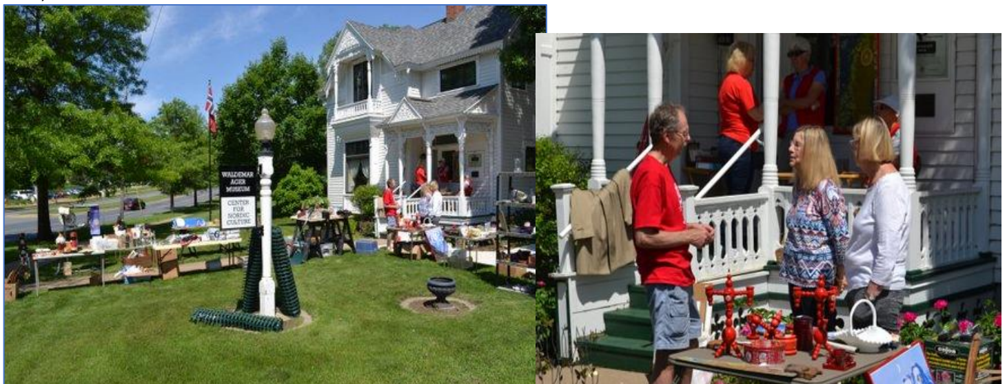
Second, the Annual Midsommar Event on June 23