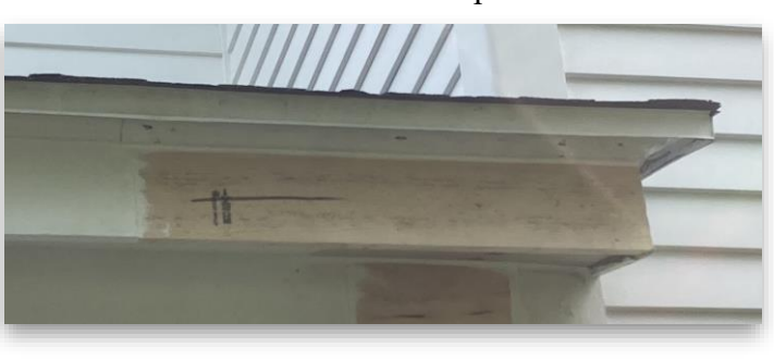
Then it's patched