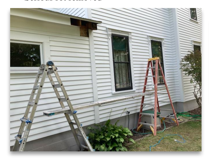
Serious rot removed