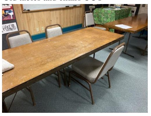
Old tables and chairs OUT